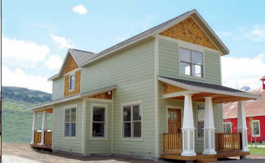
3 Bedrooms, 2½ Baths