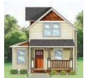
This elevation shows 5' sidewalls upstairs & a vaulted roof, the larger photo above shows 8' sidewalls & standard flat ceiling.